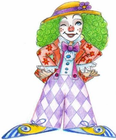
Illustrations by Patricia Krebs ©