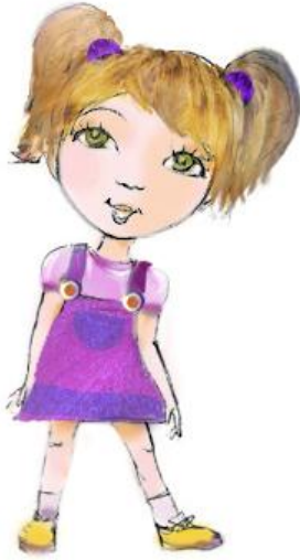
Illustrations by Patricia Krebs ©