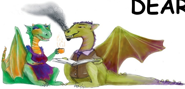
Illustrations by Patricia Krebs ©